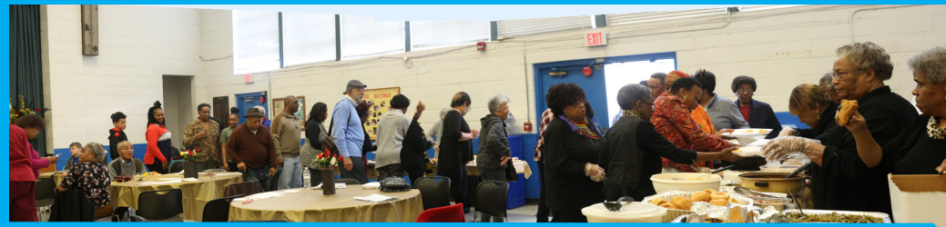
A fantastic turn out for our Annual Black History Celebration. Enjoying the large potluck lunch