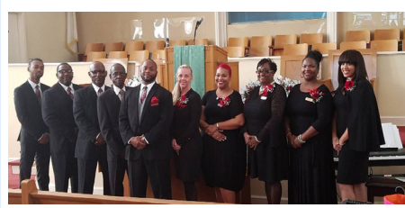
542 Hendersonville Road, Asheville, NC 28803