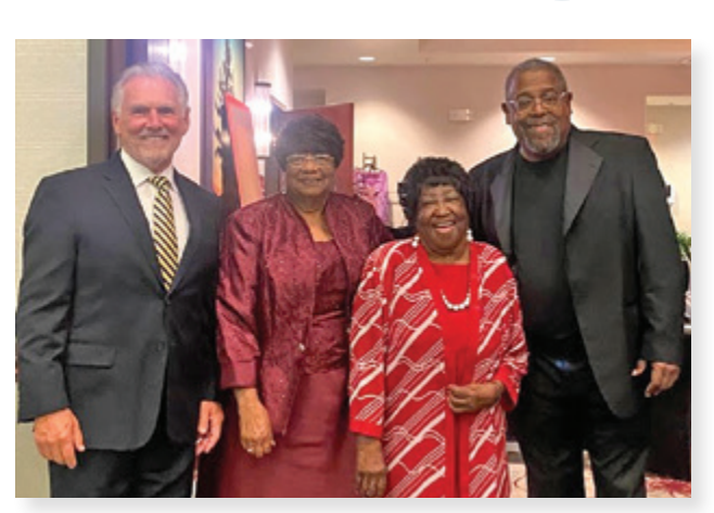
WNC Bridge Foundation with SCA officers.

These combined events raised over $53,000. These funds will continue to support the vision of the Shiloh Community Resource Center, a much needed home for the Shiloh Community Association.